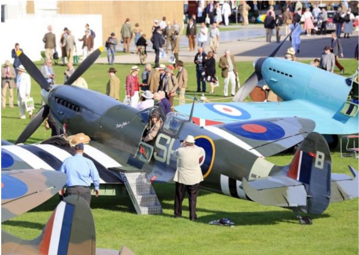
Spitfires as part of the display at last year's Goodwood Revival

Goodwood also believes the South Downs National Park would be negatively affected by a new Lavant bypass around the city, and fears it would put at risk major events like the Festival of Speed.