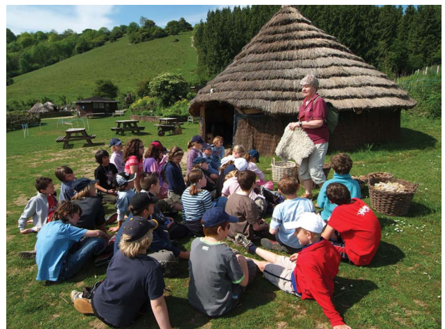
Butser Ancient Farm, Chalton, Hampshire