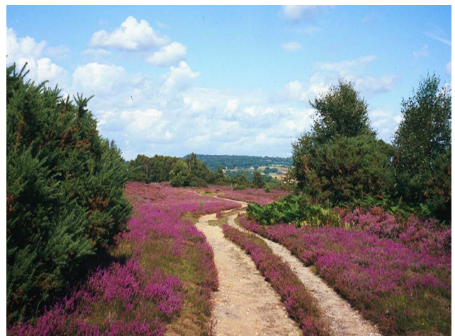
Heathland habitat, Iping Common, West Sussex