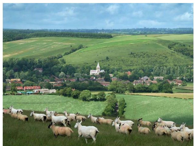
Sheep in the Meon Valley, Hampshire