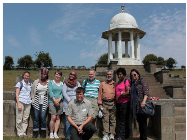
The Chattri, above Brighton, East Sussex