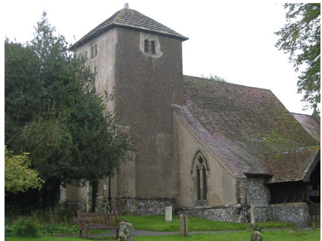
Saxon Church, Singleton, West Sussex