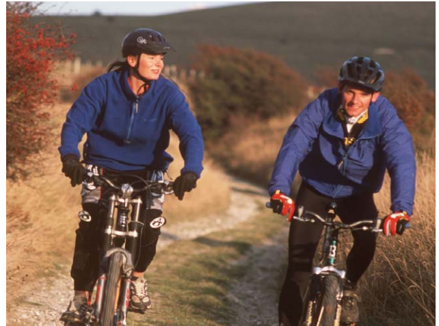
Cycling on the South Downs Way

The variety of landscapes, wildlife and culture provides rich opportunities for learning about the South Downs as a special place, for the many school and college students and lifelong learners. Museums, churches, historic houses, outdoor education centres and wildlife reserves are places that provide both enjoyment and learning. There is a strong volunteering tradition providing chances for outdoor conservation work, acquiring rural skills, leading guided walks and carrying out survey work relating to wildlife species and rights of way.