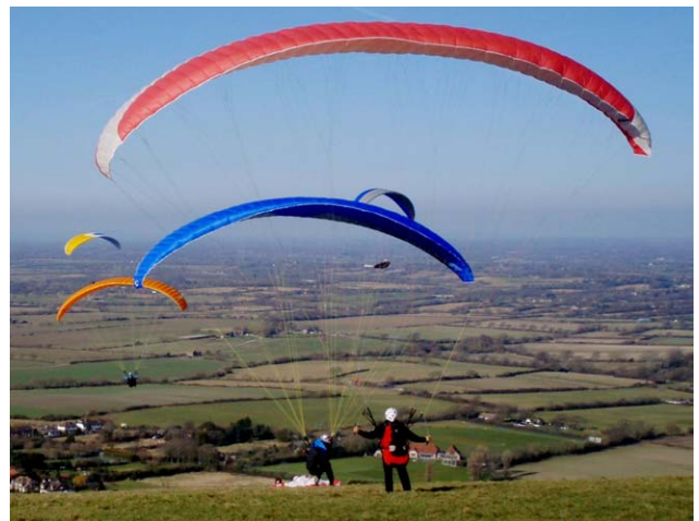
Paragliding near Lewes